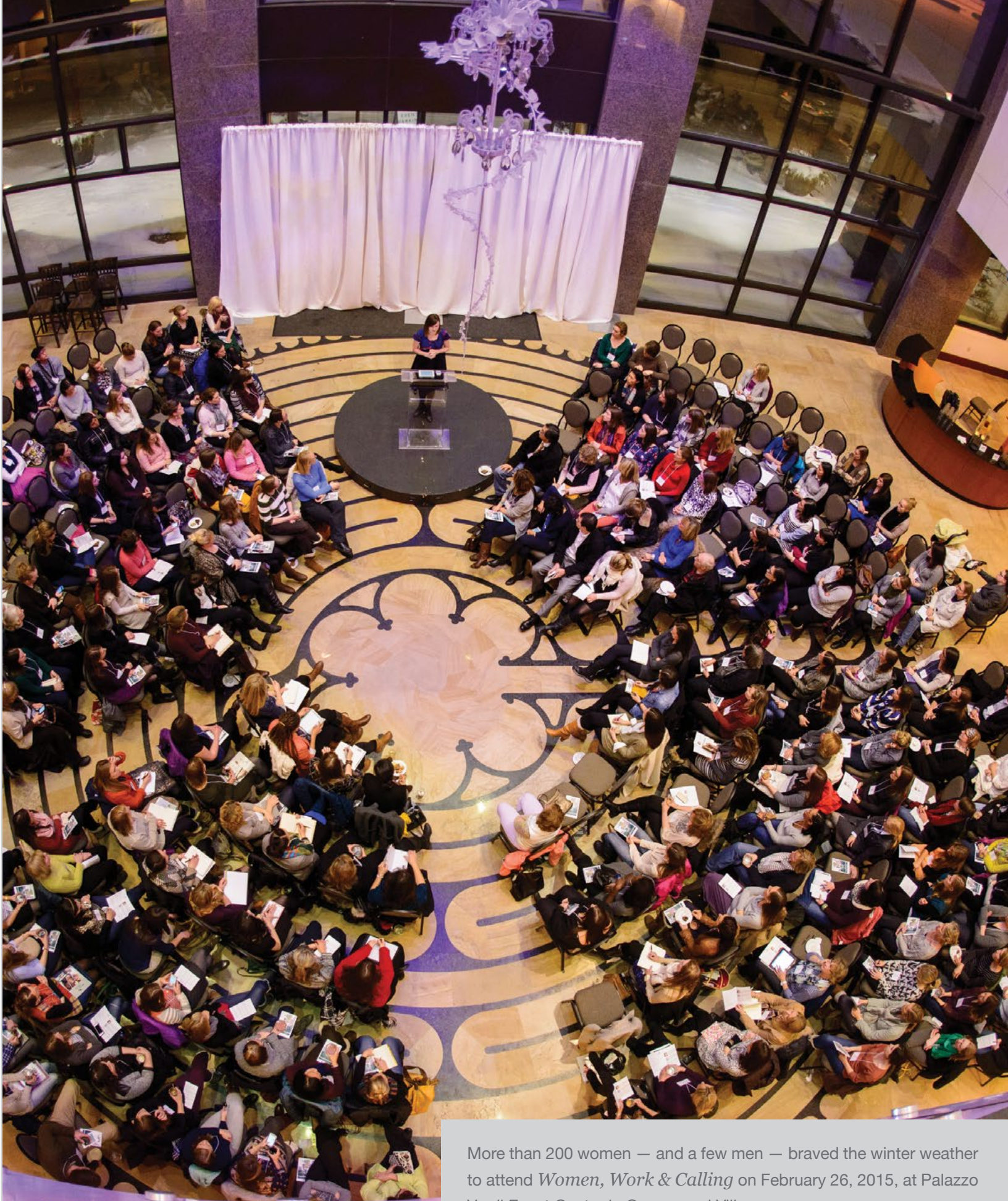
More than 200 women — and a few men — braved the winter weather to attend Women, Work & Calling on February 26, 2015, at Palazzo Verdi Event Center in Greenwood Village.